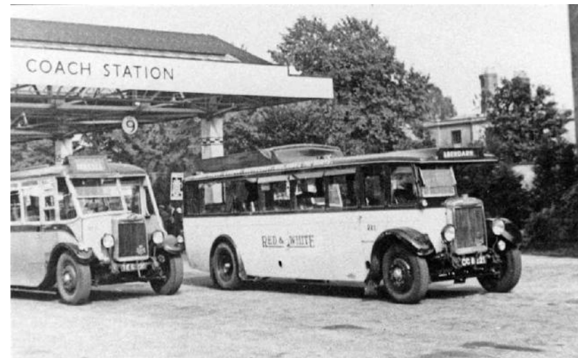
ex-Great Western Express 1930 Leyland Tiger GC 8221 (213) in early 1930s Red & White livery at Cheltenham Coach Station.