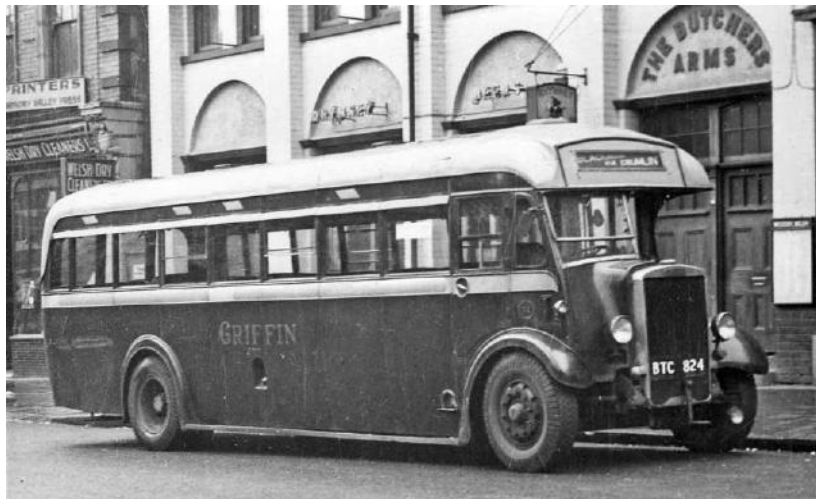
1937 Leyland Tiger TS7 BTC 824 with Leyland B32F bodywork (later Red & White 597 and S2337) in original Griffin livery of dark red and grey outside the Butchers Arms in Blackwood.