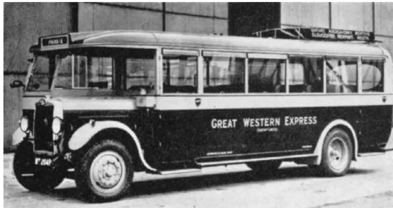
1929 Leyland Tiger MT 2049 in Great Western Express livery with Dodson C22D bodywork. This vehicle lost its body in a fire when 6 months old and was rebodied with another Dodson body ( M Mayo Collection )

† The 1948 Duple C35F body on BDW 6 was transferred to Leyland Tiger EU8526 (S2647) in 1953 and the chassis disposed of.