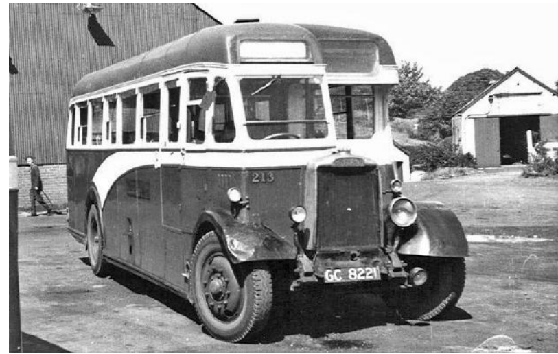
GC 8221 (213) rebodied by Duple and photographed after transfer to United Welsh.