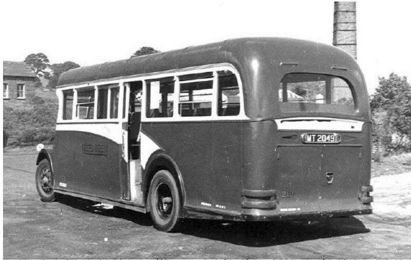
transfer to United Welsh. (Alan B Cross)