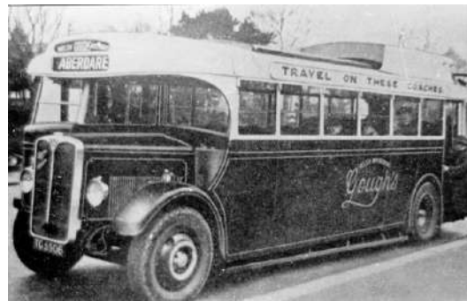
TG 5506 (later 299) with original Short bodywork in Gough's Welsh Motorways livery.