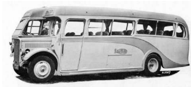
Blue Belle 1930 Regal GJ 8071 (later Red & White 716) in two tone blue livery as rebodied in 1939 with Duple C32F coachwork. ( Duple Coachbuilders Ltd )