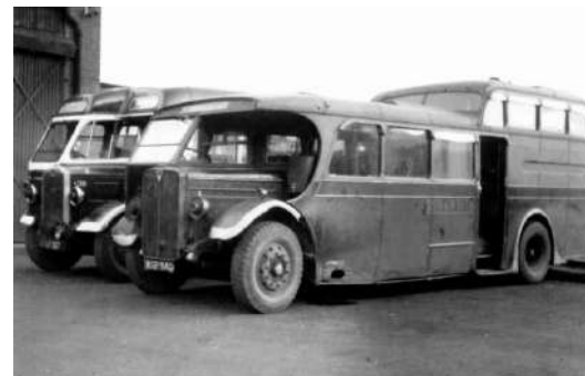
ex-Blue Belle Regal AGP 842 in wartime Red & White livery with original London Lorries coachwork.