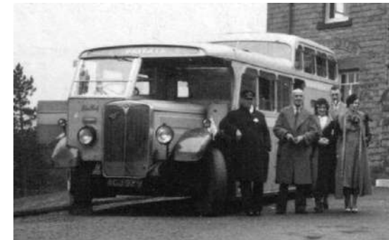
Blue Belle observation coach AGJ 929 photographed in 1933 at Bettws-y-Coed. (Glyn Bowen)