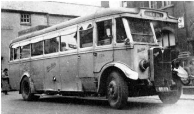
ex-Blue Belle GO 119 (B24) with original London Lorries C32R bodywork in Agincourt Square, Monmouth.