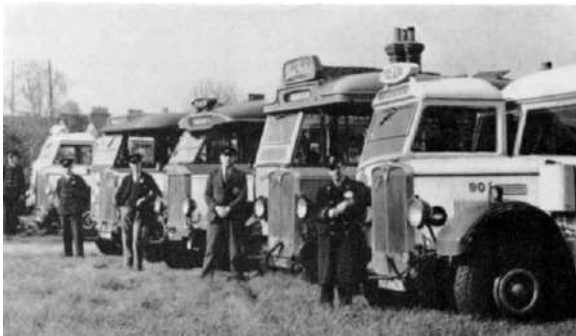
Nearest the camera is the unusual ex-South Wales Express Arlington/Meltz-bodied Regal PJ 3828 (90) with separate drivers cab and V-fronted passenger cabin. Immediately behind is Blue Belle Regal GO 119 (later 724).

Fleet Nos. in red are reallocated numbers from withdrawn vehicles. Ex-Blue Belle vehicles initially carried the Blue Belle fleet number prefixed with B and 7xx numbers were applied a few years later. * These vehicles were originally Blue Belle 6, 10, 14, 17, 32 and 33 and may or may not have been acquired by Red & White. If acquired they may have been requisitioned or otherwise disposed of before renumbering in the 7xx series.