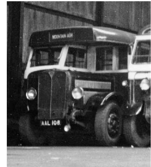
ex-Cheltenham District Traction 1933 Regal AAL 108 (715) with Weymann B32F bodywork. ( Alan B Cross )