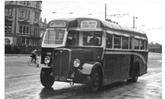
Another ex-Blue Belle Regal GF 5129 (109) with rebodied 1941 Duple B35C coachwork.