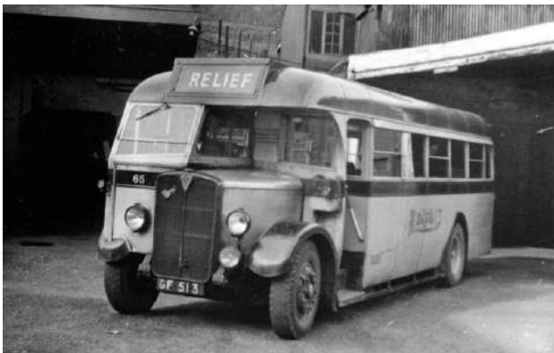
Ralph's Garages Regal GF 513 (later Red & White 622) with rebodied 1942/3 Burlingham coachwork. GF 513 started life as Green Line T130