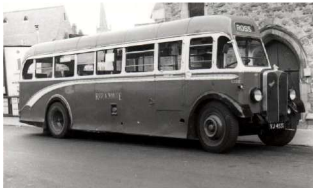
ex-Nell Gwynne 1932 Regal VJ 4537 (S332) rebodied with bus bodywork by Duple in 1942.