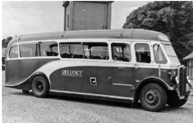
1930 Regal GH 8093 was rebodied in 1939 with Duple C32F coachwork, here shown in Reliance livery with Red & White 1951 fleet number C230.