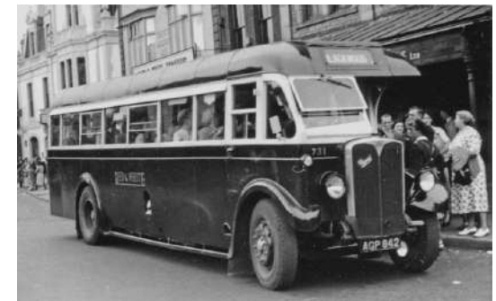
ex-Blue Belle Regal AGP 842 (731) with rebodied 1944 Burlingham B34F coachwork. (Alan B Cross)