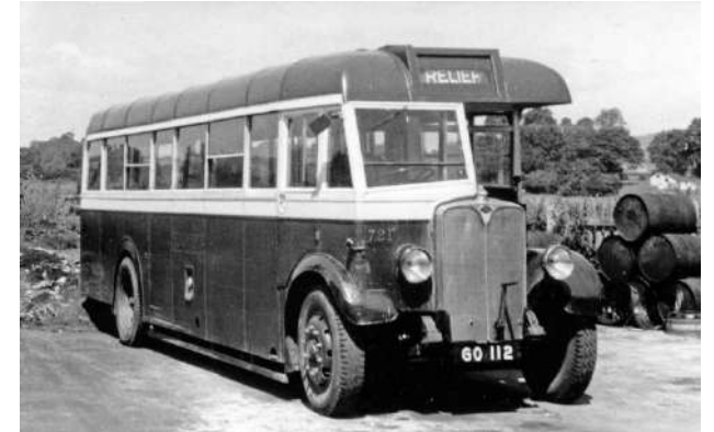
ex-Blue Belle GO 112 (721) rebodied by Duple in 1942. (Alan B Cross)