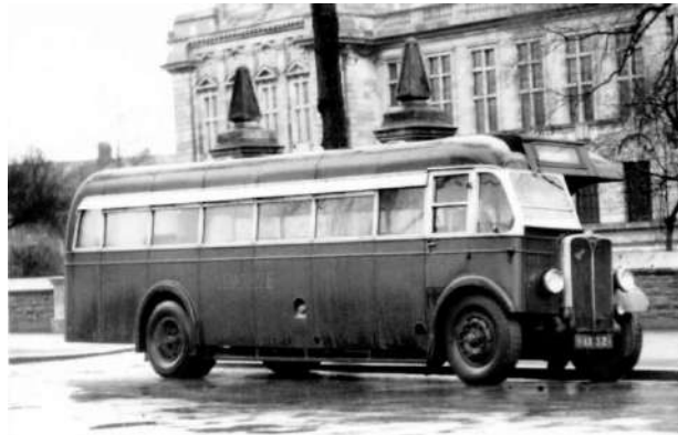
A.E.C. Regal O662 FAX 321 (S131). Originally Green Line Coaches GH 8090 with Hall Lewis C27R body, it passed to L.P.T.B and eventually to the Ministry of War Transport. It was fitted with a new Burlingham body and Gardner 5LW oil engine before entry into service with Red & White in 1944.