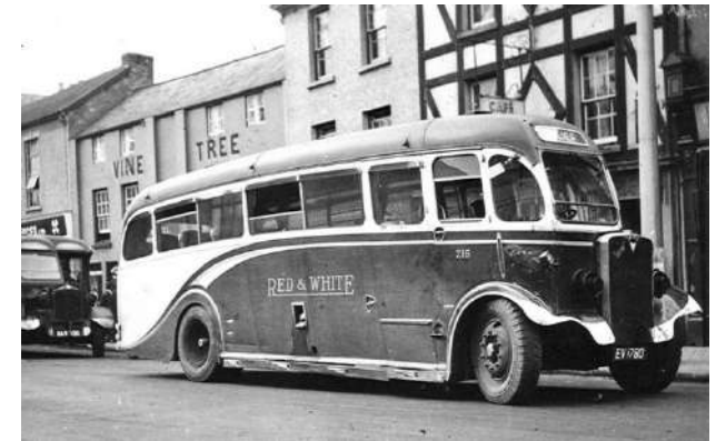
A wartime photo in Monmouth of ex-Gorseinon & District 1939 Duple-rebodied Regal EV 1780 (215) with white painted mudguards and shielded headlights.