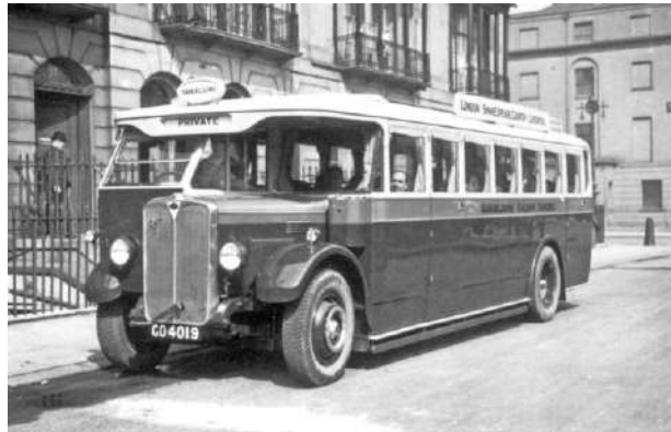
Samuelsons A.E.C. Regal GO 4019 (later Red & White 9) with Scammell & Nephew C30D bodywork before sale to Red & White in 1932.