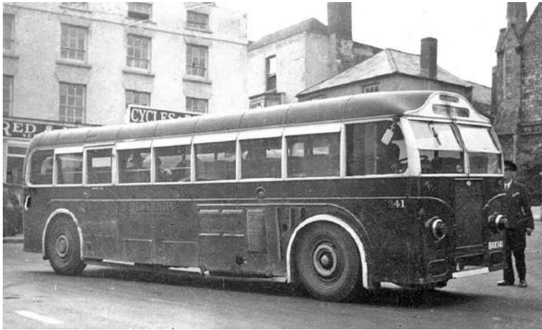
A wartime photo of BAX 141 (341) with Berw bodywork in Albion Square, Chepstow with white painted mudguards and shielded headlights.