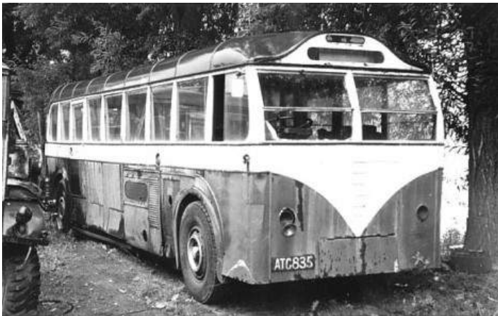
ex-Imperial Motors ATG 835 (356) with bodywork by John Norman & Co. of Cardiff, possibly after withdrawal.