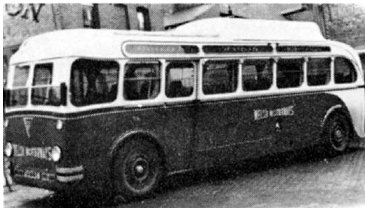
Gough's Welsh Motorways ATX 338 with Northern Counties bodywork, later Red White 279.