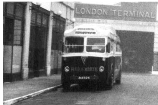
AAX 826 (280) with Northern Counties bodywork.