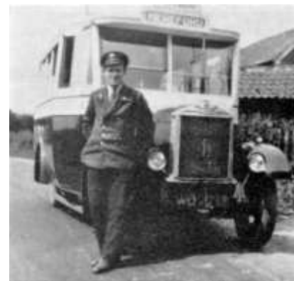
1929 Albion LB40 WO 2713 (133).