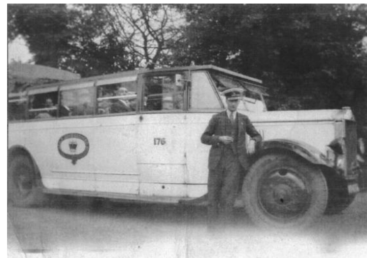
1930 Albion PNC26 WO4266 (176) with Northern Counties bodywork in early Red & White livery with Garter and Buckle device