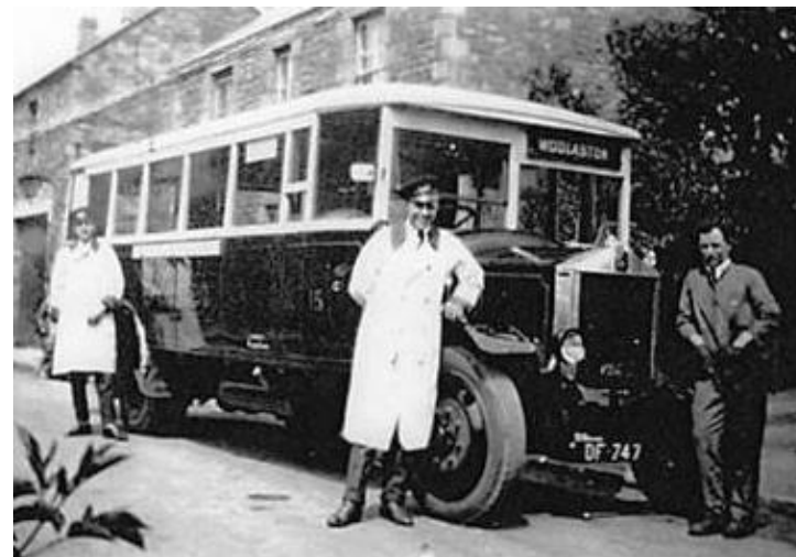
Albion PK26 DF 747 in service in 1927.