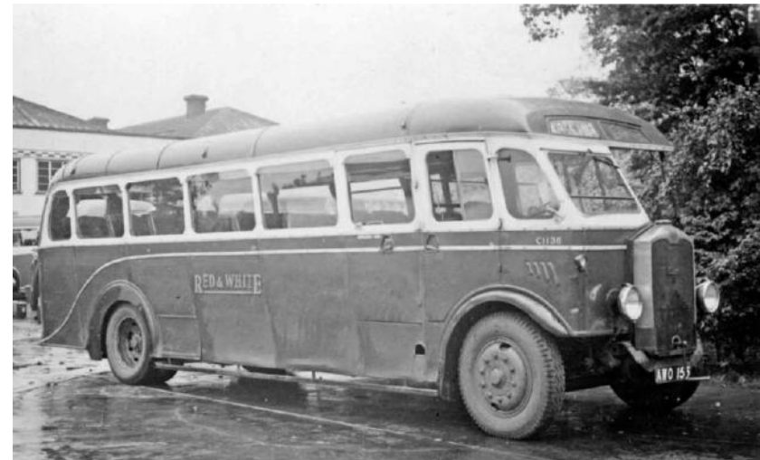
ex-Liberty Motors AWO 155 (C1136) with roof luggage box removed, photographed after fleet renumbering in 1951.