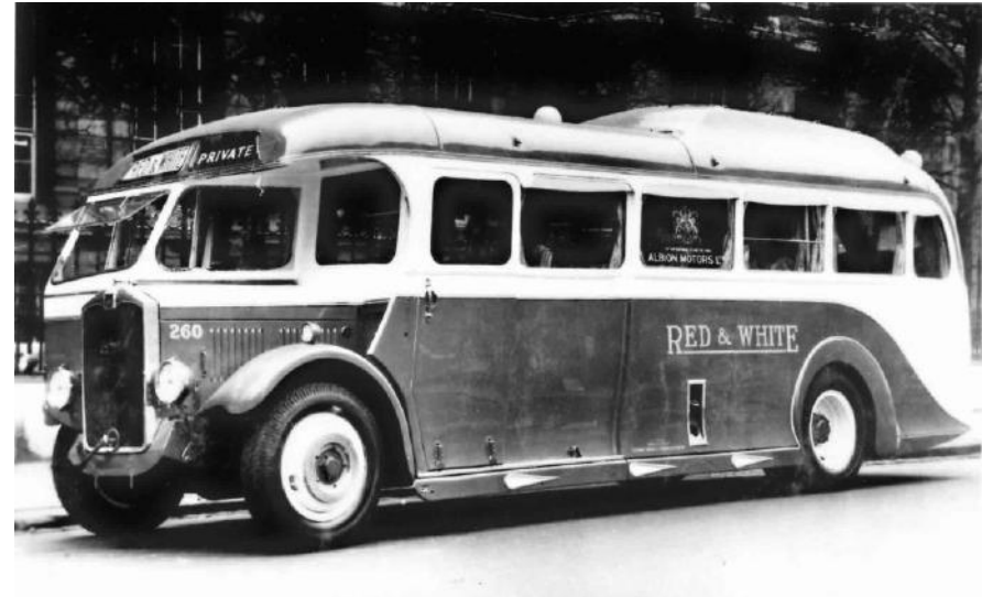
AAX 352 (260) with Duple C32F coachwork photographed when new in 1935 possibly at the time of the Olympia Show before number plates were applied.