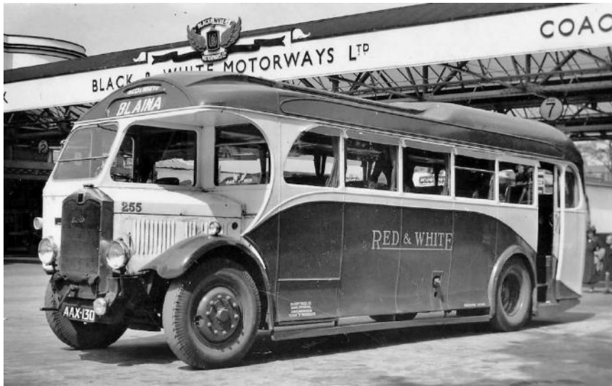
AAX 130 (255) with original Gloster bodywork at Cheltenham Coach Station