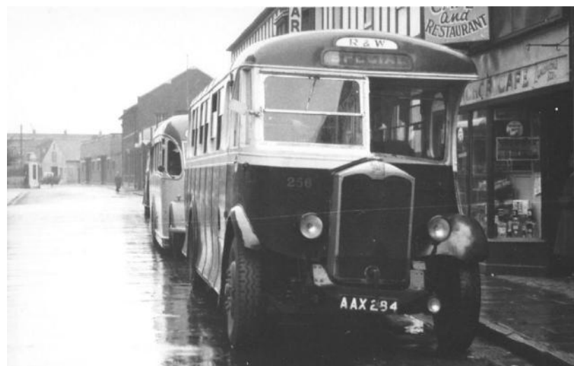
Front view of AAX 284. Liberty Motors Bedford OB HAX 657 and Red & White Albion SpPW69 AAX 876 behind - photos in sections 2.8 and 2.4 respectively. (Alan B Cross)