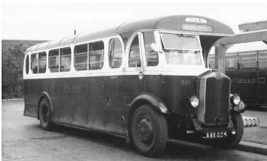
Albion Valiant AAX 284 (256) with Northern Counties bodywork. (S E Letts)