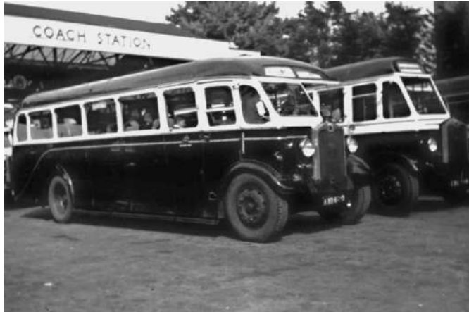
ex-Liberty Motors Albion SpPV141 AWO 620 at Cheltenham Coach Station illustrating the 1936 style of coachwork with full width canopy.