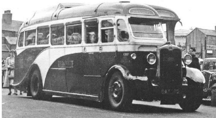
BAX 325 (C337), photographed in the 1950s with a variation of the early coach livery.