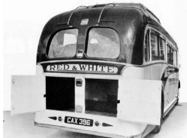
Above and right: 1938 CAX 696 (396) in original livery. Due to a mix up with reserved registrations an incorrect registration was carried when photographed. ( Duple Coachbuilders Ltd. )