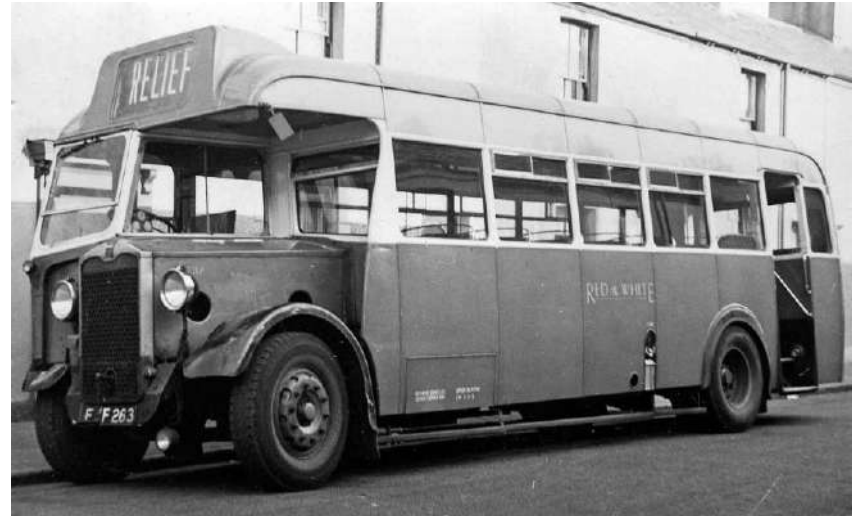
ex-Blue Belle EXF 263 rebodded by B.B.W. in 1950 as a B35R bus.