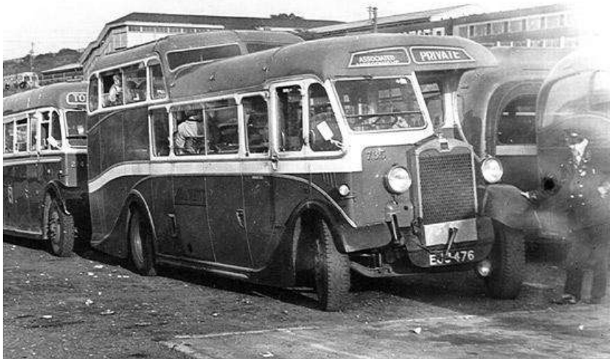
EJJ 476 (736) at Barry Island in Red & White livery before rebodding as a normal coach.