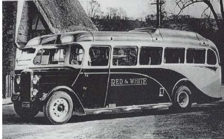
BAX 326 (326), one of the 1937 deliveries, with roof-mounted luggage carrier. The 1937 coaches featured the half canopy design in contrast to the full width canopy of the earlier models.