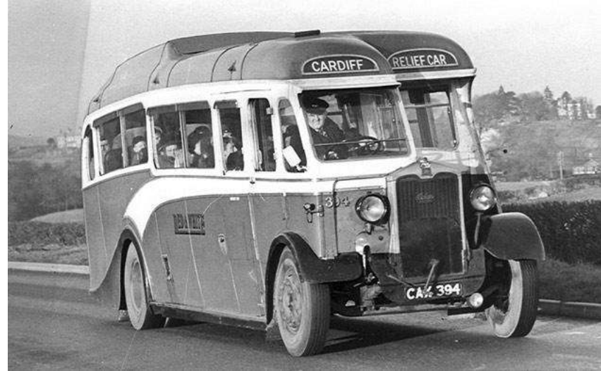
One of the 1938 batch CAX 394 (394) now provided with a curved and stepped waistline and windows with alternate slim pillars to give each pair of windows the illusion of a divided sheet of glass.